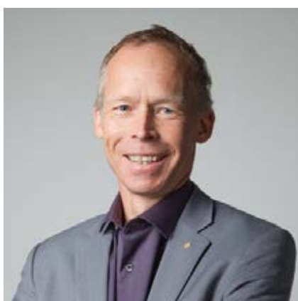
Prof Johan Rockström

Dr John N. Nkengasong is a distinguished public health leader. He is the former U.S. Global AIDS Coordinator and head of the Bureau of Global Health Security and Diplomacy at the U.S. State Department. This bureau centralized efforts against global health threats, including HIV/AIDS, and houses PEPFAR, symbolizing a major stride in integrating health security within U.S. national security and foreign policy. With a robust background including former Executive Director for the Africa CDC and leading Africa's COVID-19 response, Dr Nkengasong's tenure has been marked by significant global health contributions and recognitions, establishing him as a pivotal figure in contemporary public health advocacy and action.