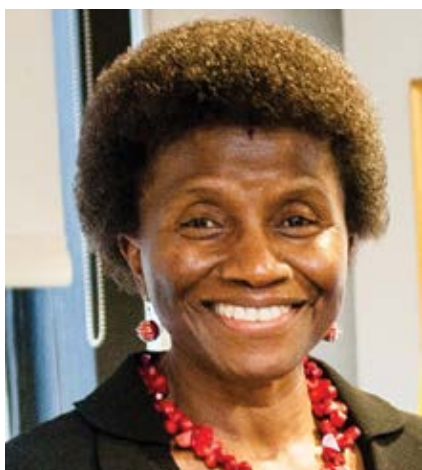
Ms Joy Phumaphi