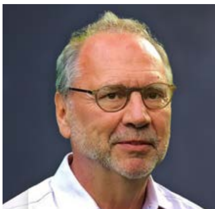
Prof Peter Piot